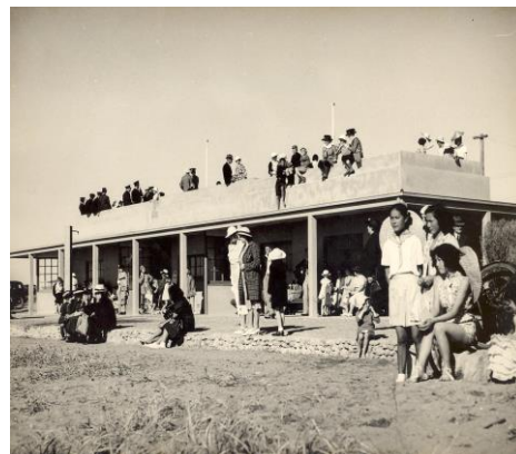
Opening of the beach pavilion, 1938

Continuing the theme of Ōtaki - he kāinga takitoru, he hāpori takitahi | Ōtaki – three villages, one community we've now started work on our next exhibition featuring the Ōtaki beach community. If you have any stories or memorabilia you'd like to share, please get in touch, we'd love to hear from you.